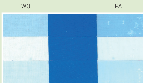
Polyamide/elastane Shade ocean (water severe)